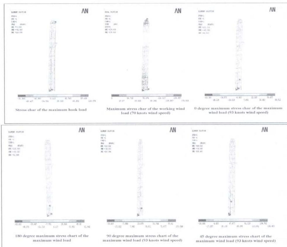
Figure.1 The maximum stress pattern of four kinds of combined working conditions

The static strength requirement of derrick: if stress in any part of the structure has reached the calibrated yield strength \sigma_s , then the structures have been destroyed [4]. It is critical state of carried structure when stress has reached the yield strength according to this requirement. API (American petroleum institute standard) consider that safety coefficient of static strength of derrick must be above 1.67 in order to meet the safety requirement. The maximum stress pattern of four kinds of combined working conditions ( Fig 1 ) were showed.